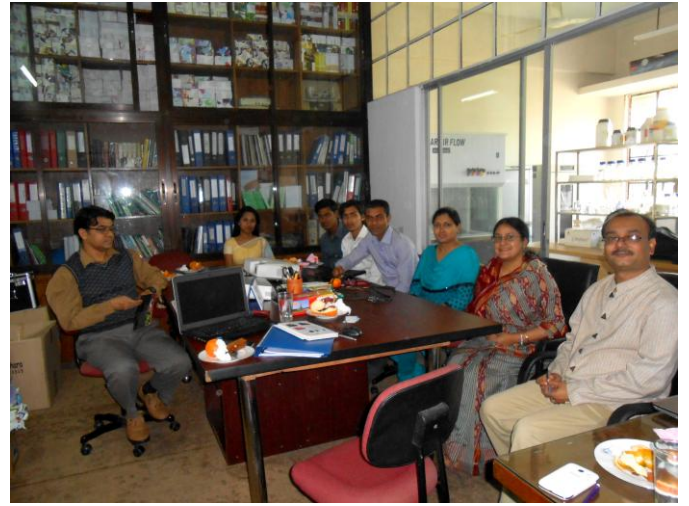
Meeting held at the Department of Zoology, Jahangirnagar University