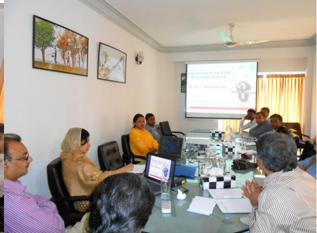
Meeting held at the Conference Room, IUCN